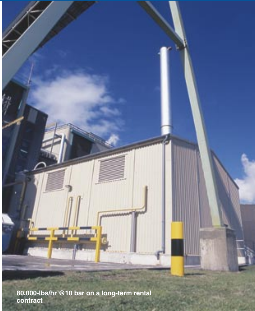
80,000-lbs/hr @ 10 bar on a long-term rental contract