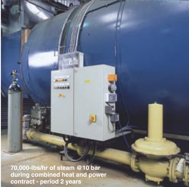
70,000-lbs/hr of steam @ 10 bar during combined heat and power contract - period 2 years