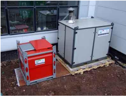
HeatGEN 100kw mobile boiler houses and 1000-litre FuelPAK bundled fuel tank (fitted with internet based fuel monitoring telemetry)

Watkins Hire installed a mobile oil fired LPHW heating boiler to dry newly laid concrete screed flooring at the new build industrial building in Wolverhampton.